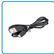
Micro USB Cable